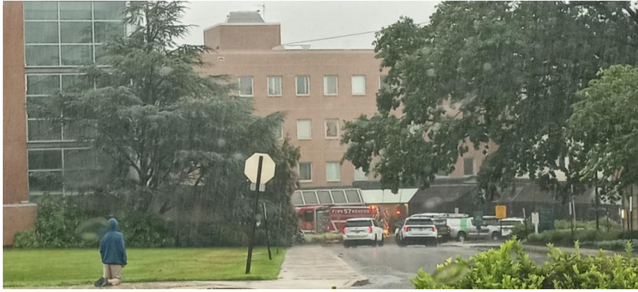
One man kneels in prayer in the pouring rain outside the Delaware County Women's Center abortion facility in Chester, PA. during a July 31, 2025 Red Rose Rescue